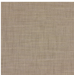
BB-LM-44 OLD WOOD