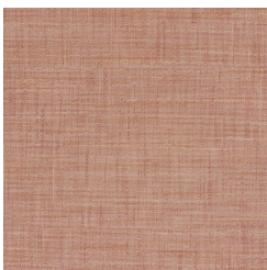
BB-LM-47 HIMALAYAN SALT