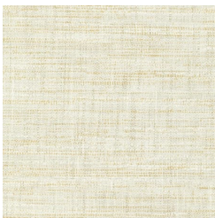
BB-LM-26 ONE TRUE BEIGE