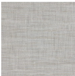
BB-LM-41 RIVER ROCK