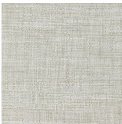
BB-LM-23 TRANQUIL GREY