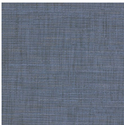
BB-LM-39 ZEN BLUE