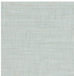
BB-LM-38 SOOTHING GREEN