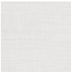
BB-LM-37 WHITE DOVE