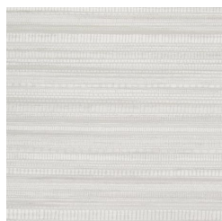
W2-LA-01 NORTH POLE