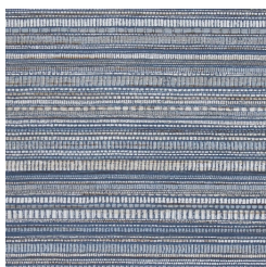
W2-LA-02 BLUE HORIZON