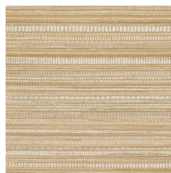
W2-LA-14 AMBER AXIS