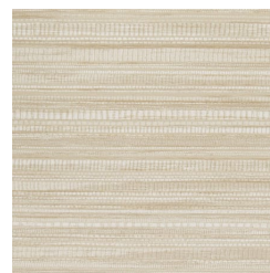
W2-LA-10 ECRU EQUATOR