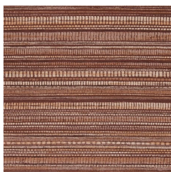
W2-LA-12 MAROON MERIDIAN