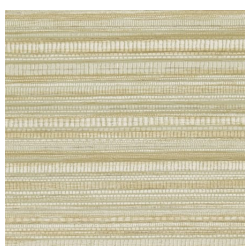
W2-LA-17 LIME LINE