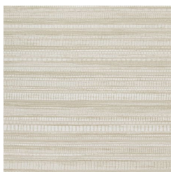
W2-LA-07 ROCK SALT