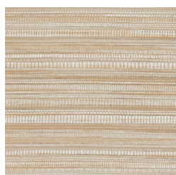
W2-LA-16 PEBBLE PLAIN