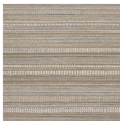
W2-LA-08 MOON- DUST