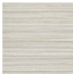
W2-LA-04 SMOKEY VORTEX