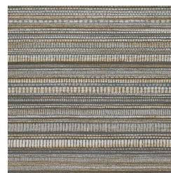
W2-LA-05 GRAVITY GREY