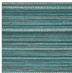
W2-LA-03 SEA LEVEL