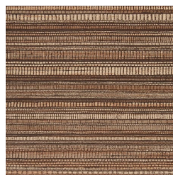
W2-LA-09 STELLAR SADDLE