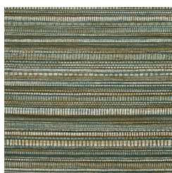
W2-LA-18 EARTH GREEN