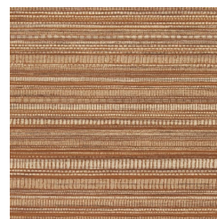
W2-LA-15 OCHRE ORBIT