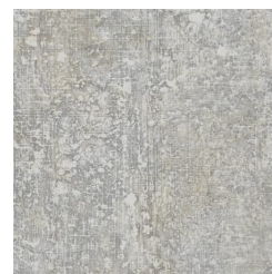
JN21-04 RIVER ROCK