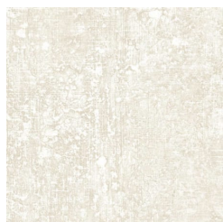
JN21-01 PAPER BIRCH