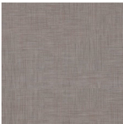
A183-524 COPPER- NICKEL