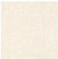
A183-007 BAY EAST