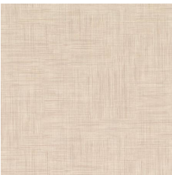
A183-190 SAND DOLLAR