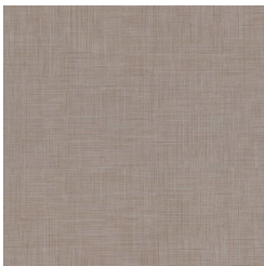
A183-563 LONDON FOG