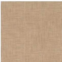
A183-466 BUTTER RUM