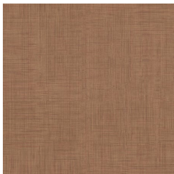
A183-667 EARTH TONE