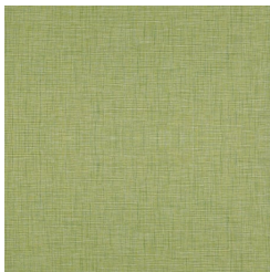
A156-274 GRANNY SMITH APPLE