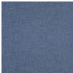
A156-310 MIDNIGHT EXPRESS