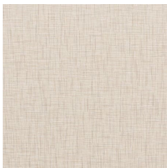
A156-101 SPRING WOOD