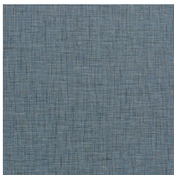
A156-396 SHERPA BLUE