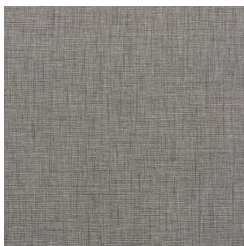
A156-592 DARK SLATE