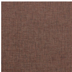
A156-635 BAKERS CHOCOLATE