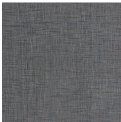
A156-388 NIGHT RIDER