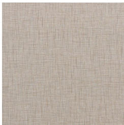
A156-861 STAR DUST