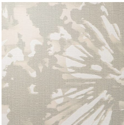
A193-008 WHITE MYLAR