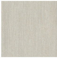
BX4453 LUCKY COIN