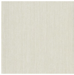
BX4452 QUASI- MAGICAL