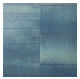
A180-386 BLUE LAGOON