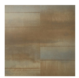
A180-598 BRONZE AGE