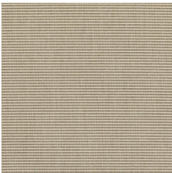
7761-0000 TAUPE/ BEIGE