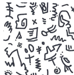
990 BLACK WHITE