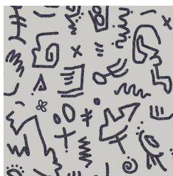
583 GREY STONE