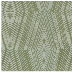
1011327 LILY PAD