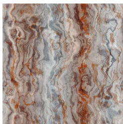
748 PECAN SPICE