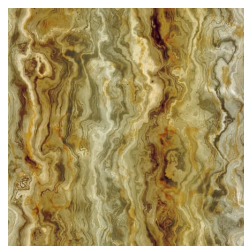
315 ANTIQUE GOLD