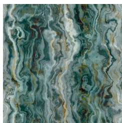
298 EMERALD GOLD