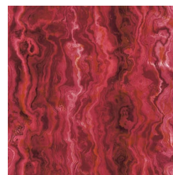
451 RED SMOKE