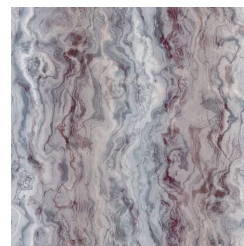
978 PEWTER MINK