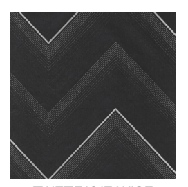
T117TF1617 WISE BLACK