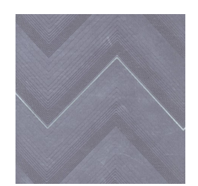
T117TF1615 ICE BLUE