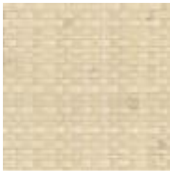
FD280 01 DRIFTWOOD BUFF UP