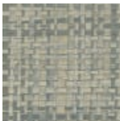
FD280 12 DRIFTWOOD NATURAL SLATE