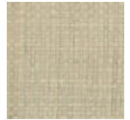
FD280 05 DRIFTWOOD CAMEL