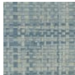
FD280 09 DRIFTWOOD SHY BLUE