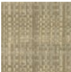
FD280 06 DRIFTWOOD MUSHROOM DRIFTWOOD