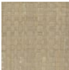
FD280 07 DRIFTWOOD HOT CHOCOLATE