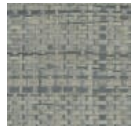
FD280 10 DRIFTWOOD SAGE NAVY