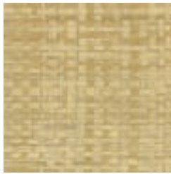
FD280 02 DRIFTWOOD SAND