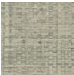
FD280 11 DRIFTWOOD REED