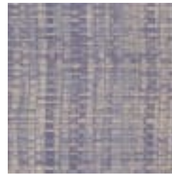
FD280 04 DRIFTWOOD PURPLE