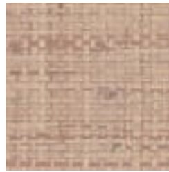
FD280 03 DRIFTWOOD BLUSH RED