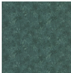
AZ53402 JUNGLE GREEN