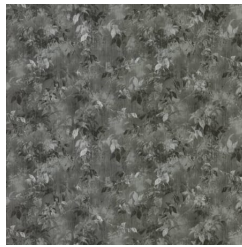
AZ53397 STARRY SAFARI