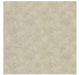
AZ53399 BOTANICAL BEIGE