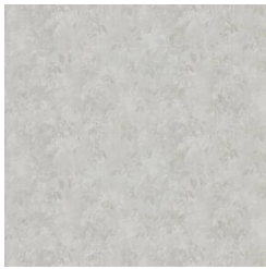
AZ53395 PEARLY PARADISE