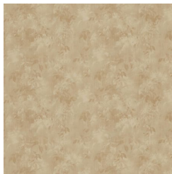
AZ53401 GOLDEN OASIS