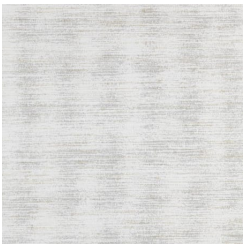
BB-RB-01 WHITE LIGHTS