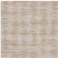
BB-RB-10 TECHNO TAN