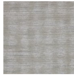
BB-RB-03 CLOUDY CLUB