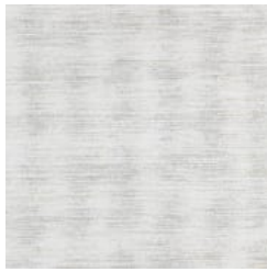
BB-RB-01 WHITE LIGHTS