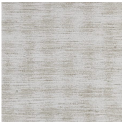
BB-RB-02 FADED FLASH