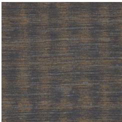
BB-RB-08 DARK DISCO