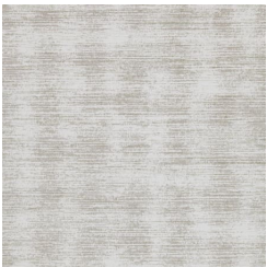
BB-RB-05 PALE PULSE