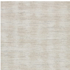
BB-RB-06 BEIGE BOOGIE