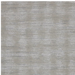
BB-RB-03 CLOUDY CLUB