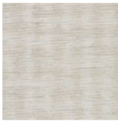
BB-RB-06 BEIGE BOOGIE