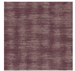
BB-RB-12 MULBERRY MADNESS