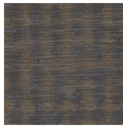
BB-RB-08 DARK DISCO