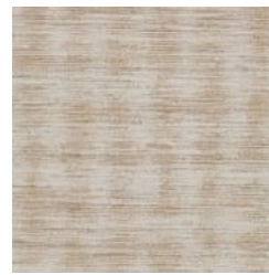
BB-RB-10 TECHNO TAN