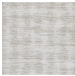
BB-RB-05 PALE PULSE