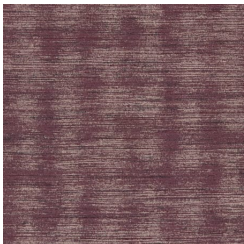
BB-RB-12 MULBERRY MADNESS