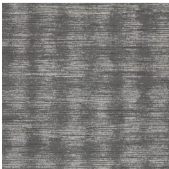
BB-RB-04 ELECTRONIC EVENING