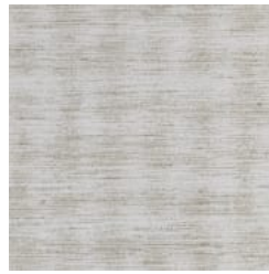
BB-RB-02 FADED FLASH