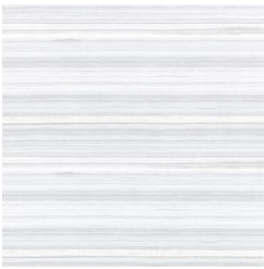
BB-NW-01 OPAL WHITE