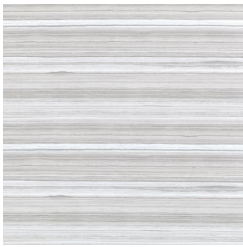
BB-NW-04 CREMA MARFIL