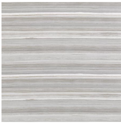
BB-NW-05 SILVER TRAVERTINE