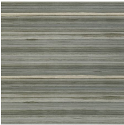
BB-NW-08 GREY STONE