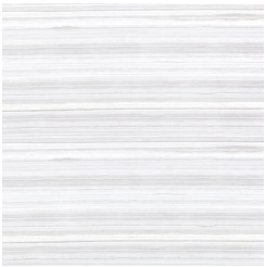
BB-NW-07 MONT BLANC