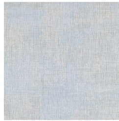
BB-HH-02 SKYSCRAPER BLUE