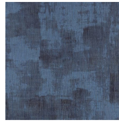
BB-HH-03 COBALT CLUB