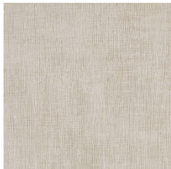
BB-HH-10 BOHO BEIGE