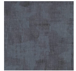
BB-HH-04 SUBWAY SLATE