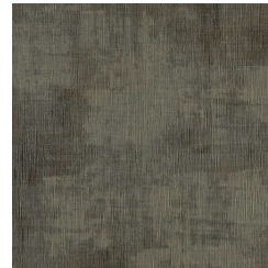
BB-HH-08 HUGO MOSS