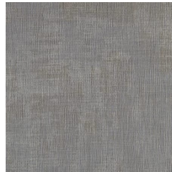
BB-HH-07 GALLERY GREY