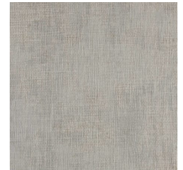
BB-HH-09 CAFFE CREAM