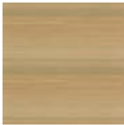
W2-SW-07 TOASTY MAPLE