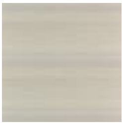
W2-SW-11 SEA SALT