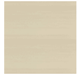
W2-SW-05 BLEACHED SAND