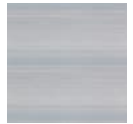
W2-SW-15 FRENCH GREY