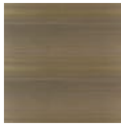
W2-SW-13 VINTAGE BRASS