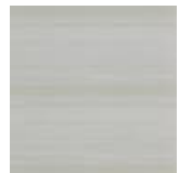
W2-SW-20 GREY VAPOR