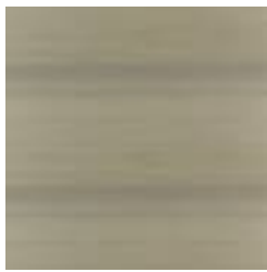
W2-SW-12 GOLDEN GREY