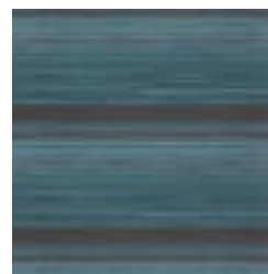
W2-SW-19 INDIGO MADRAS