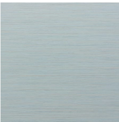
A163-384 SKY HIGH