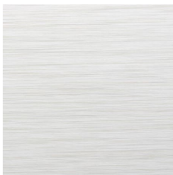
A163-087 SEA SALT