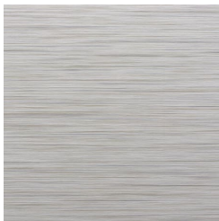
A163-881 DORIAN GRAY