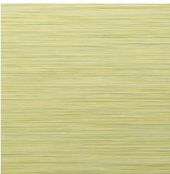
A163-293 BAMBOO LEAF