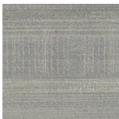
W2-MT-02 SMOKED PLATINUM