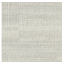
W2-MT-03 LIQUID LEAD