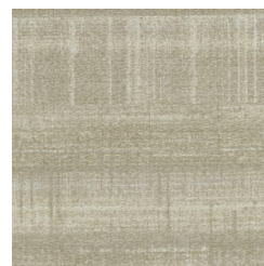
W2-MT-05 FUSED GOLD