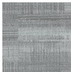
W2-MT-04 SMOLDERING SILVER