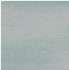
W2-HZ-08 INFINITE BLUE