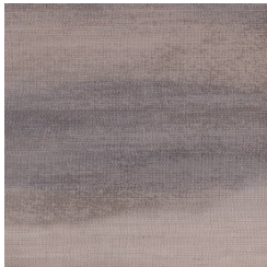
W2-HZ-06 DUSKY SUNSET