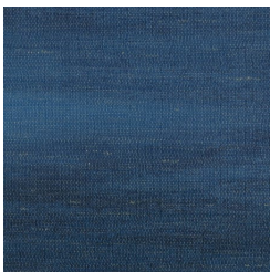
W2-HZ-04 EDGE OF NIGHT