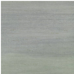
W2-HZ-09 LUSH VISTA