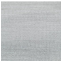
W2-HZ-01 WHITE CAP