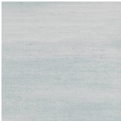
W2-HZ-07 CLEAR SKIES