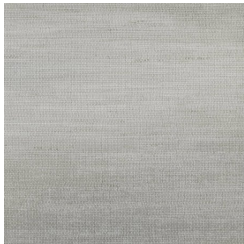
W2-HZ-05 MISTY GREIGE