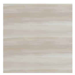
BB-GF-06 DESERT TAUPE