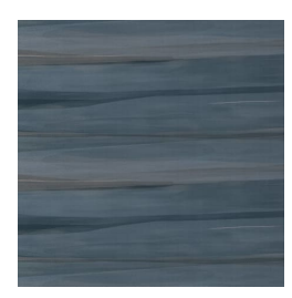
BB-GF-02 MIDNIGHT BLUE