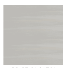
BB-GF-04 SATIN GREY