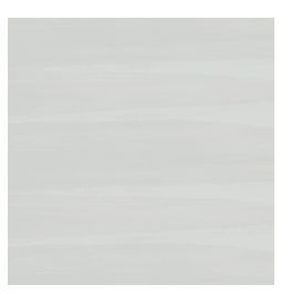
BB-GF-03 WHITE WASH