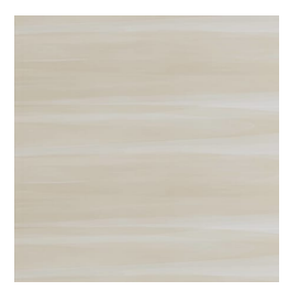
BB-GF-05 WARM SAND