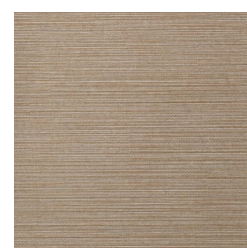
ASL-139569 CORAL SAND