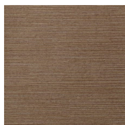
ASL-139503 COFFEE BEAN