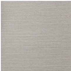
ASL-139892 SILVER LEAF