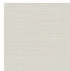
ASL-139156 EGG SHELL