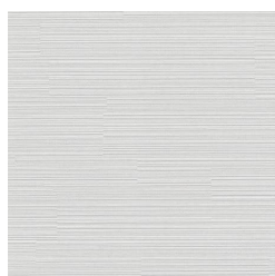
ASL-139012 SEA SALT