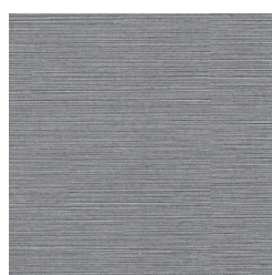
ASL-139531 EARL GREY