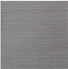
ASL-139845 STORM CLOUD