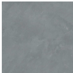
SG05-08 BLUE KYANITE