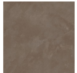
SG05-10 RIVER ROCK