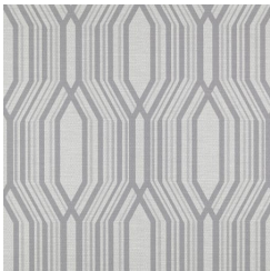
BB-BG-02 RICE FIELD