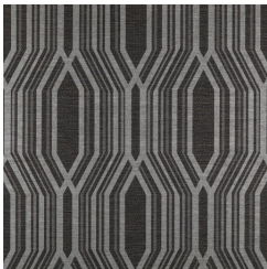
BB-BG-03 BLACK COBRA