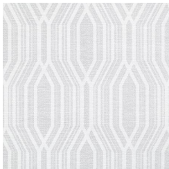
BB-BG-01 WATER LILY