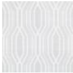
BB-BG-01 WATER LILY