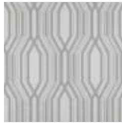
BB-BG-02 RICE FIELD