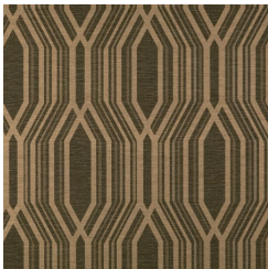
BB-BG-04 ARABICA BEAN