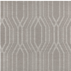
BB-BG-06 STONE CARVING