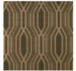
BB-BG-04 ARABICA BEAN