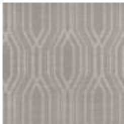
BB-BG-06 STONE CARVING