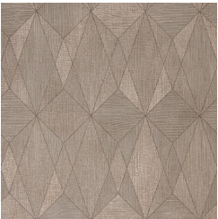
A204-519 SUMMIT (MYLAR)