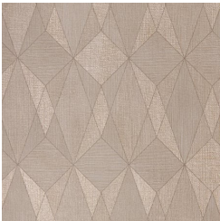
A204-522 TWILIGHT (MYLAR)