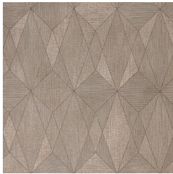
A204-519 SUMMIT (MYLAR)