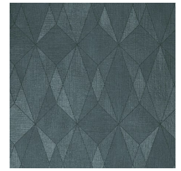
A204-323 BLUE MOON (MYLAR)