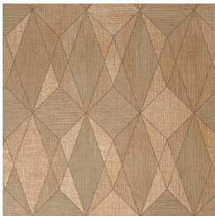
A204-775 GOLD (MYLAR)