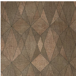
A204-581 SHALE (MYLAR)