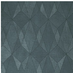
A204-323 BLUE MOON (MYLAR)