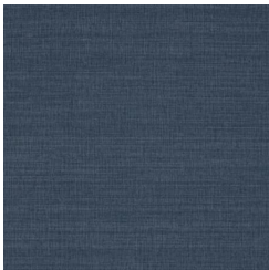
MDV1084 PETROL BLUE