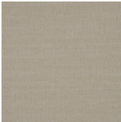
MDV1086 CREME BRULEE