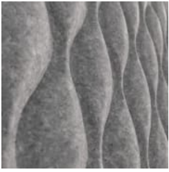
zindra- embossed_sandglass_p ewter_promo_2.jpg