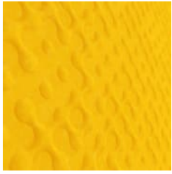
zindra- embossed_molecular_s unshine_promo_2.jpg