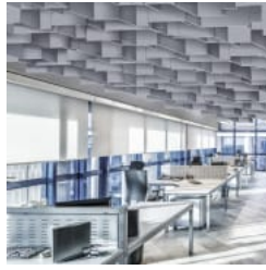
Baffle Connect Rise High