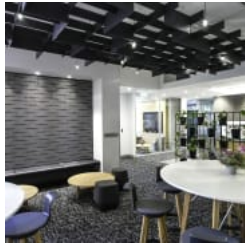
Baffle Connect Rise Low Tar