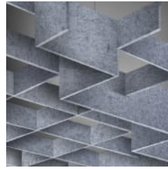
Baffles Connect Rise Detail in Cadet