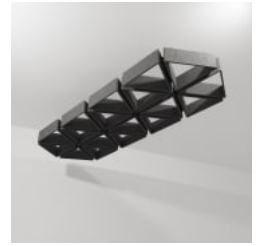
Baffles Connect Prismatic Detail