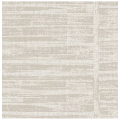
BB-GP-05 – PLATINUM PEARL