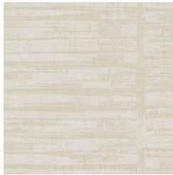
BB-GP-06 – CHALKED GOLD