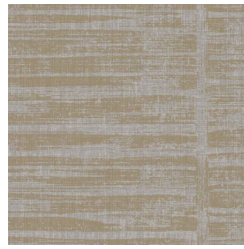
BB-GP-02 – BRONZED STONE