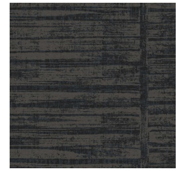
BB-GP-04 – BLACK METAL