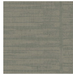
BB-GP-03 – SAGE PATINA