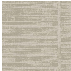
BB-GP-07 – AMBER GRACE