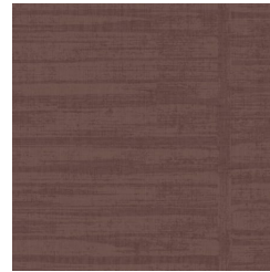
BB-GP-08 – COPPER PLUM