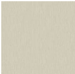
A211-794 DESERT SAND