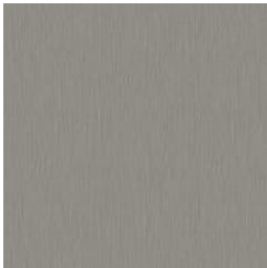
A211-456 STILL LIFE