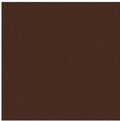
A211-175 CHERRY WINE