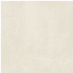
WARM CREAM BB-TU-09