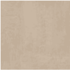
RUSTIC CLAY BB-TU-10