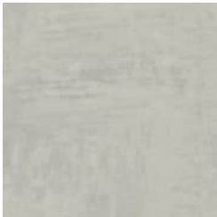
SMOKY SAGE BB-TU-07