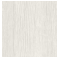
AZ53745 WHITE WASH