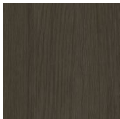
AZ53760 BLACK WALNUT