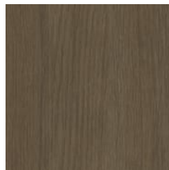
AZ53756 AGED IROKO