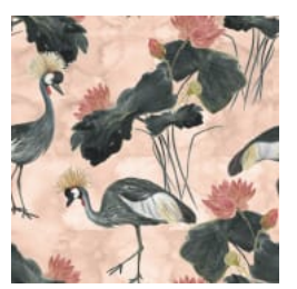
IN THE GRASS; LANDS