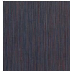
W2-SB-03 RUSTIC NAVY