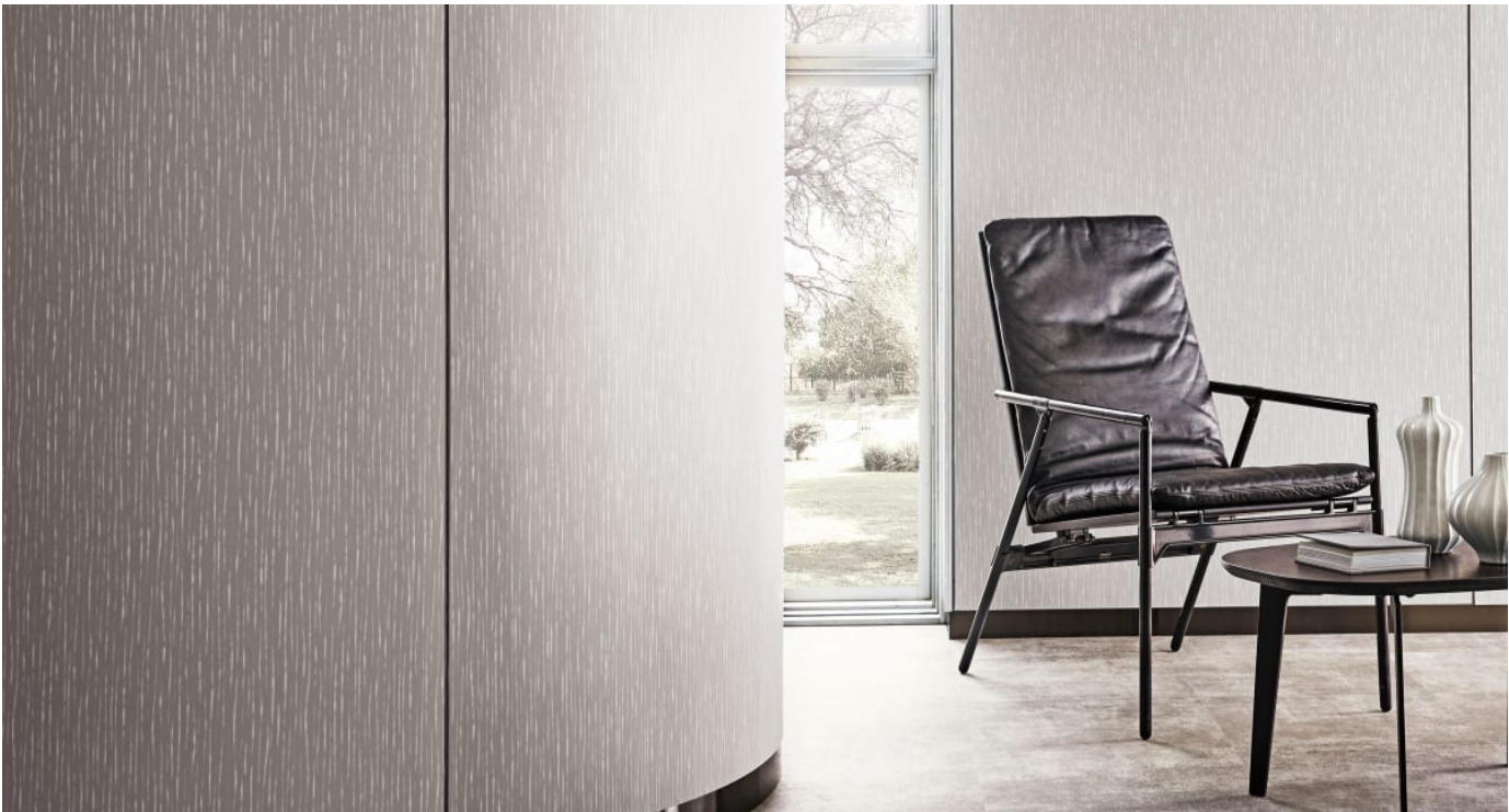
SHIZUKU - DEW