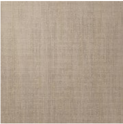
A 199-118 BARBARY SAND