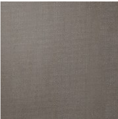
A199-806 LONDON ROAD