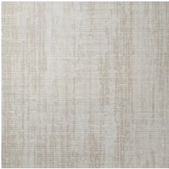
A 199-012 HINT OF VANILLA