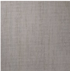
A199-801 CELTIC SALT