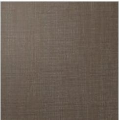
A199-601 SEPTEMBER GOLD