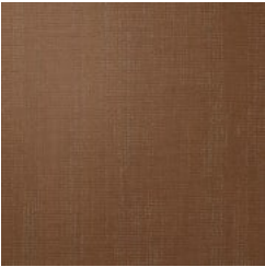
A199-402 CASA DE ORO